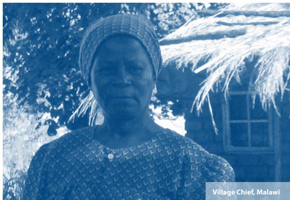
Village Chief, Malawi

The European Network on Debt and Development has analysed the Doha outcome document; their report can be accessed here: http://www.eurodad.org/whatsnew/articles.aspx?id=3218