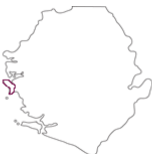
Figure 1: PLA group membership